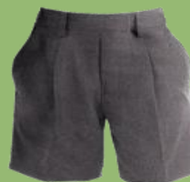
Grey Shorts (Not PE)